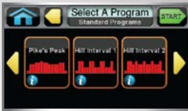
SELECT YOUR PROGRAM.