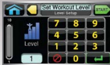
CHOOSE YOUR LEVEL.