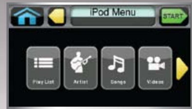
PLAY YOUR MUSIC.